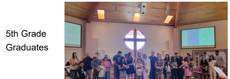
5th Grade Graduates