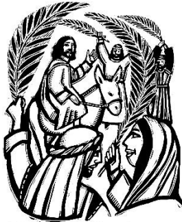
"Blessed is the king who comes in the name of the Lord!" Luke 19:38, NIV

Today begins Holy Week and our journey with Jesus through death and resurrection. Holy Week is the center of our year as Christians. This is the week upon which we draw hope and meaning for the remainder of the journey. As we continue turning toward God's abundance in devotion, look deeply with me this week at all the ways Jesus is turning toward God's abundance in the midst of this most dramatic and dynamic week. Today and the Great Three Days of Maundy Thursday, Good Friday, and the Vigil of Easter/The Resurrection of our Lord I'll offer an image to contemplate with some guiding words as you sit before the abundance of God's love.